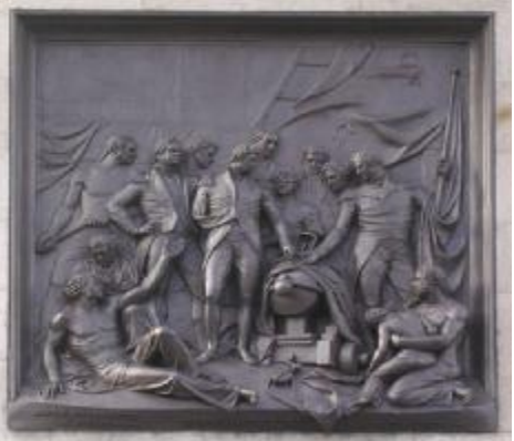
The Battle of Copenhagen 1807 by John Ternouth, east face.