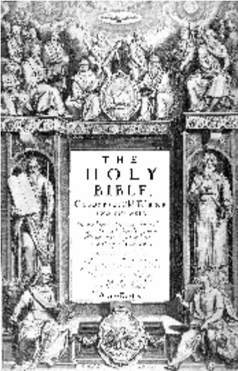
1611 Old Testament title page showing a group of Apostles with Moses & Aaron standing below them & Luke & John seated

found in many early editions of the Authorized King James Version of the Bible and tells a multitude of stories. It might partially answer the question of how long have the Anglo-Saxon-Celtic peoples been seen to originate from the so called 'Lost Tribes of Israel'? Clearly the publishers saw it as important to graphically depict these Israelites in the initial printings, and ones produced in Britain at that! Little more than a century later much was written about the origins of these people but in Tudor and early Stuart times the idea of the tribes reaching 'the appointed place' and 'fulfilling the calling of God with corresponding blessings', was being quite naturally built into the culture of the people. Only half a century prior to this Bible publication Sir Francis Drake had defeated the Invincible Spanish Armada and the Book of Common Prayer was compiled in a style as if its readers were Israelites (such as 'O Lord save thy people. And bless thine inheritance'). A few decades after the AV's printing, paintings such as Zuberan's 'The Patriarchs' depicting the 12 sons of Jacob were popularly commissioned and so on.